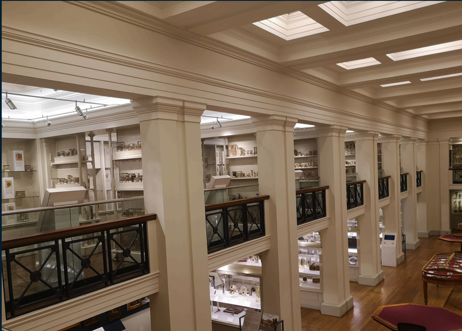
Level 4- Upper Wohl Pathology Museum

The upper level of the Wohl Pathology museum can be found on level 4. There are human remains on display in this area. The sound from the lower gallery can travel up to the upper level.