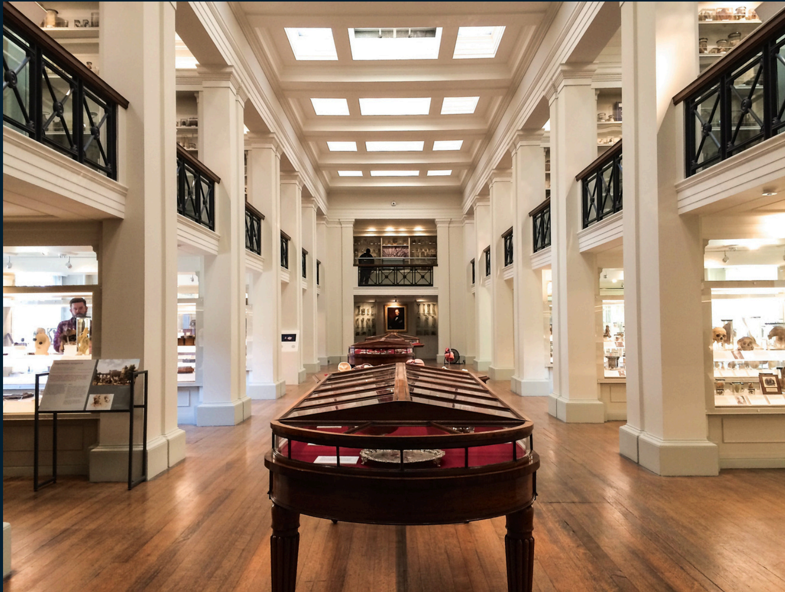
Level 2- Lower Wohl Pathology Museum

Our Wohl Pathology Museum is split over 2 levels. Lower pathology can be found on level 2. On this level there are human remains on display. There are also some videos with audio that play on this level.