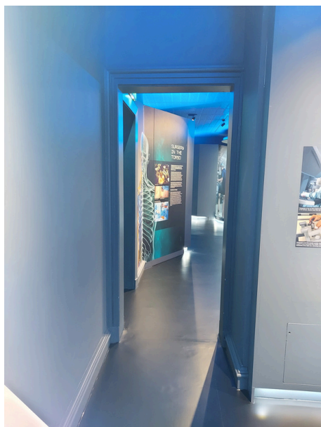
Doorway from section one of Body Voyager gallery to section 2.