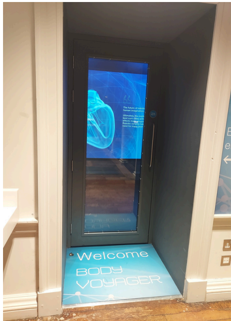
The entrance to Body Voyager from the Dental Collection on level 5. The door is 863mm wide