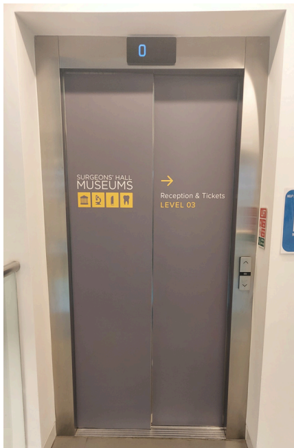
Photo showing the lift door