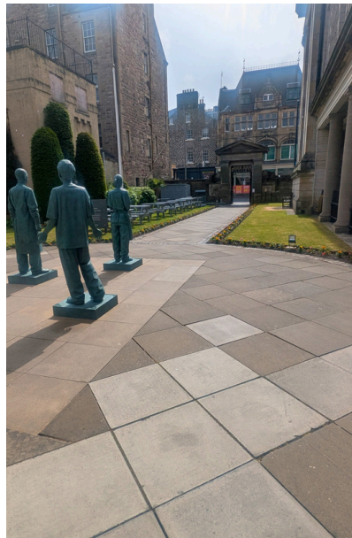
Photo of the garden, showing the narrowest part of the path