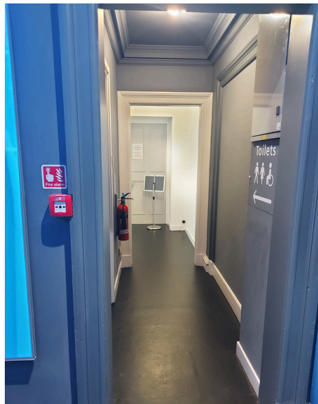
Corridor leading to toilets on level 5