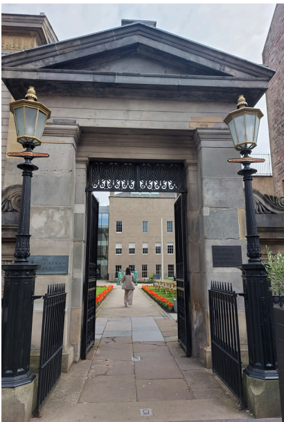
The gate to the main entrance