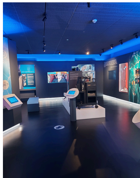
Layout of Body Voyager