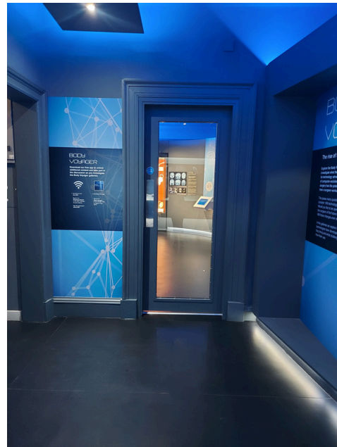
The second door to access the Body Voyager galleries. The door is 787.4mm wide