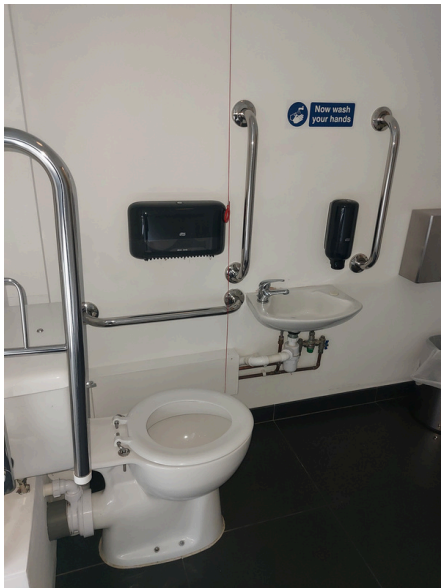
Toilet, handrails, sink and dryer.