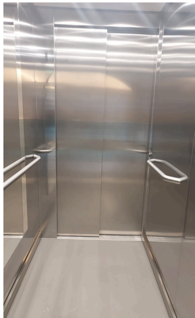
Inside the lift. There are doors on either side