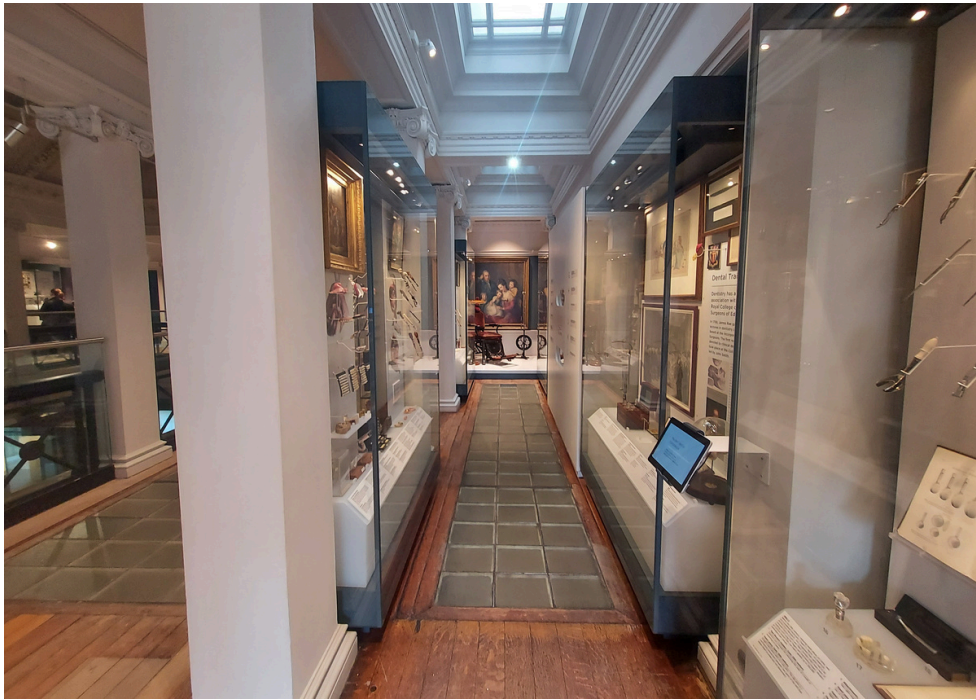
Photo showing the layout of the Dental Collection.