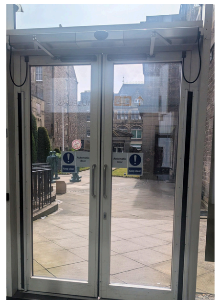
Automatic glass doors at the main entrance