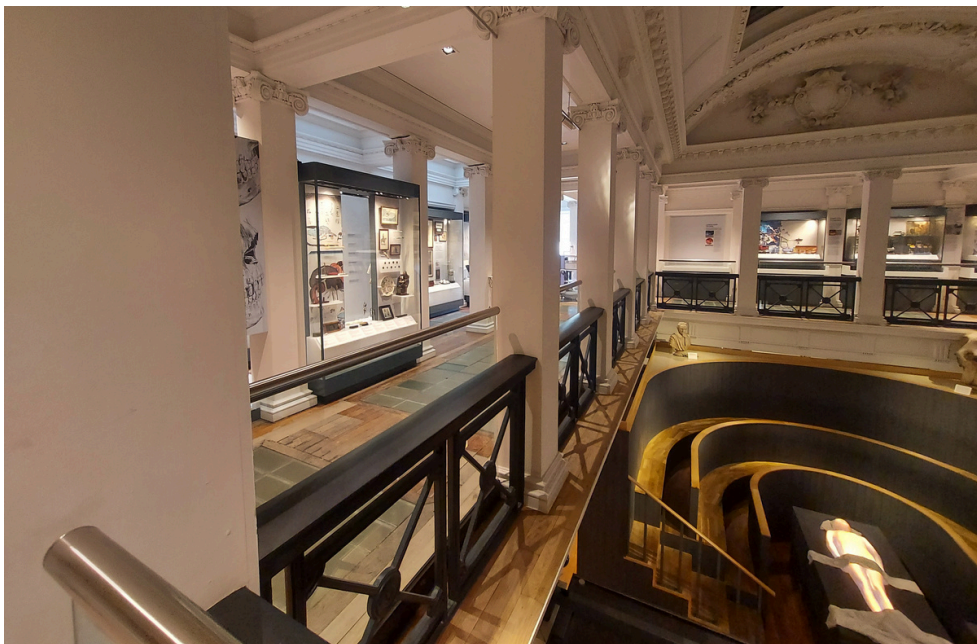
Photo showing a different perspective of the layout of the Dental Collection.