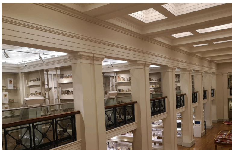
Photo showing a different perspective of the Wohl Pathology Gallery