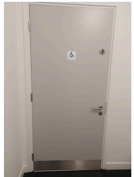
Door to toilet