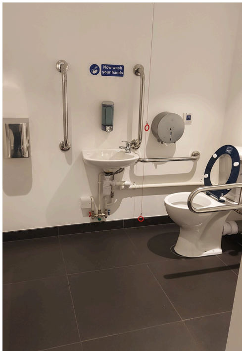
The accessible toilet. Showing the handrails, lowered sink and hand dryer and pull cord.