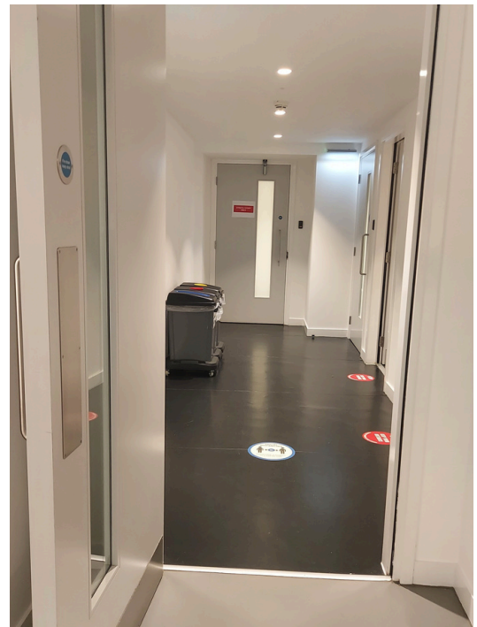
The corridor where the toilets are located. The doorway is 889 mm