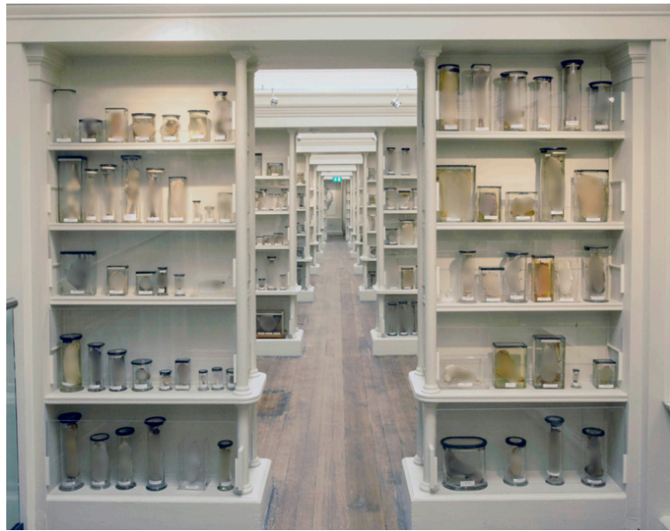
Photo showing the layout of the upper level of the Wohl Pathology Gallery.