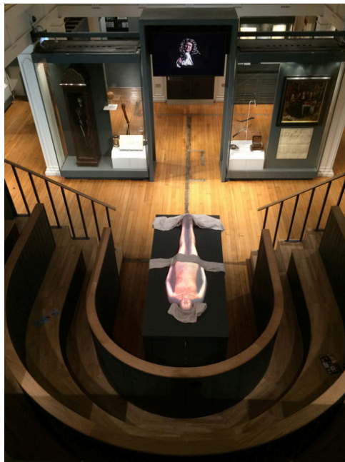
Image showing the layout of the anatomy theatre including the placement of the video screen