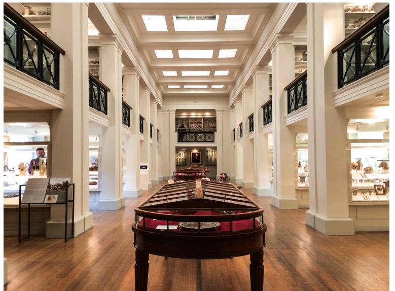
Photos showing the layout of the lower level of the Wohl Pathology Gallery