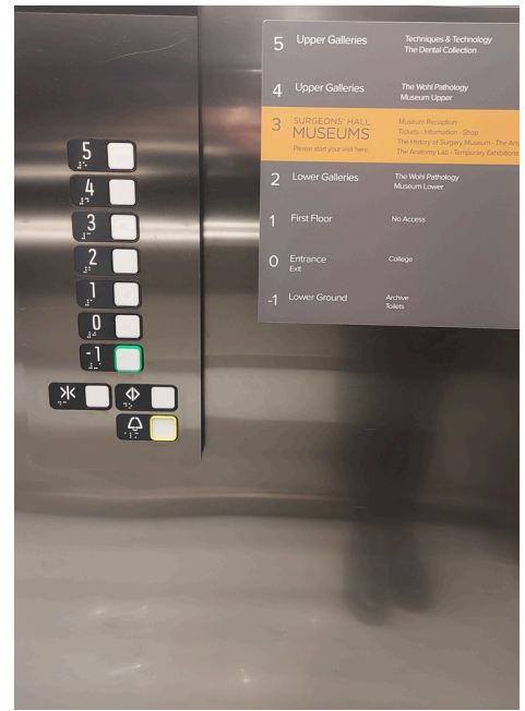
The lift buttons showing the raised areas near the buttons